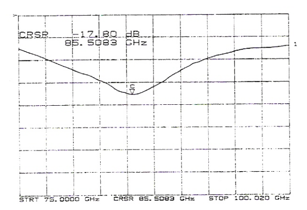
TYPICAL PERFORMANCE C-RAM MMW-3 TUNED ELASTOMERIC ABSORBER (SPECIFIED FREQUENCY)

The information in this technical bulletin, although believed to be accurate, is not to be taken as a warranty for which Cuming Microwave assumes legal responsibility, nor as permission or recommendation to practice any patented invention without license. It is offered for verification by the customer, who must make the final judgment of suitability for any application.